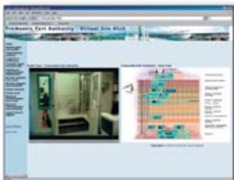
On-line interactive virtual site visit of a corporate IT installation