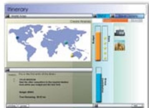
Collaborative on-line interactive challenge for university students