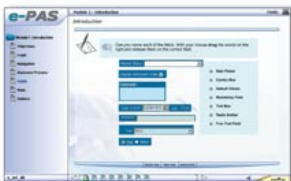
Software training developed for Global-Health's e-PAS